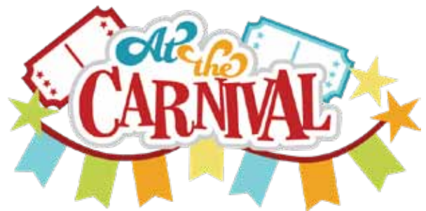
2 nd Annual Fundraiser for Youth & Leadership