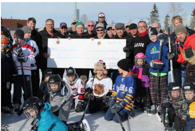
Lions Roar November 2015

The Lions Club of Leduc recently made the last installment of $50,000 on the $300,000 donation we made to the City of Leduc for a new outdoor skating rink. The Rink gets full usage in both winter and summer. As a result of this donation the Lions Club will finally be getting a park named in their honor. While the club has selected the location they would prefer the final say will be up to the city's naming committee