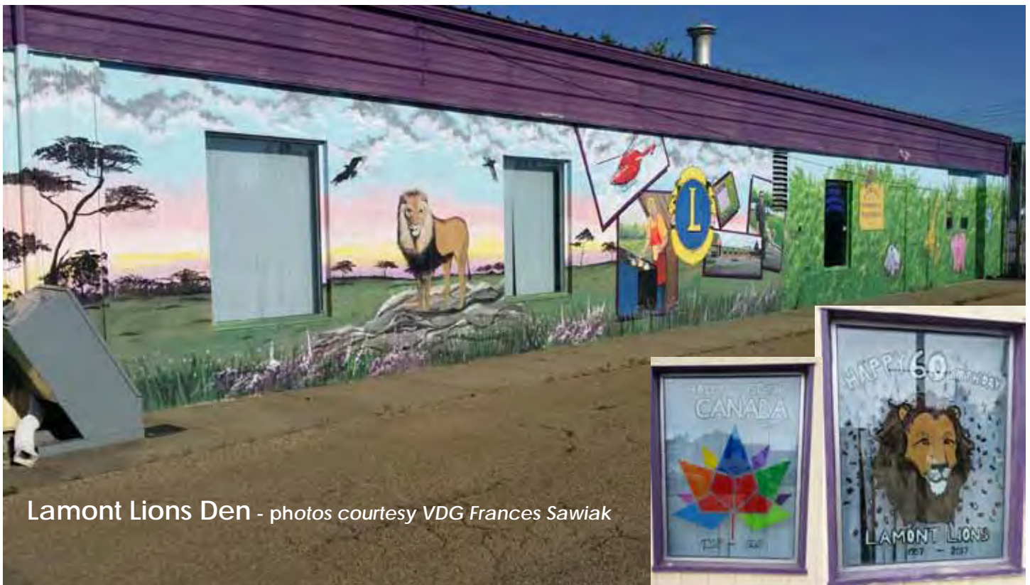
Lamont Lions Den