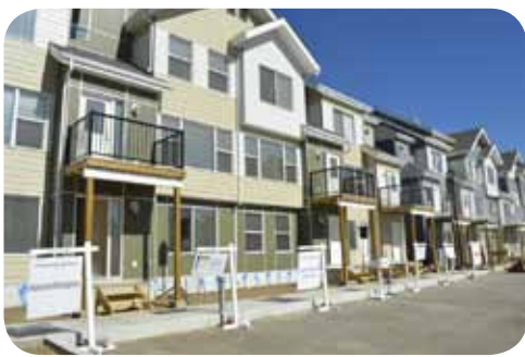
Example of a Habitat for Humanity development.

We help to keep families rooted in their community when they might otherwise have to move in order to find affordable housing. Our volunteers and community partners help us build vibrant and successful communities while they establish camaraderie, learn new skills and serve families.