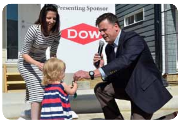
A family receives keys to their Habitat for Humanity home.

CORPORATE OFFICE: 8210 Yellowhead Trail NW, Edmonton, AB T5B 1G5 (780) 479-3566 | HFH.org