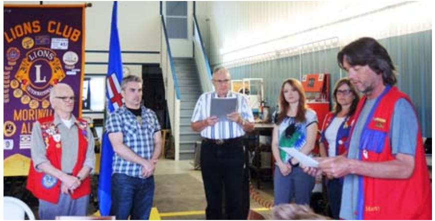
The sort of scene familiar to many of us at this time of year - the installation of officers - in this case Morinville.