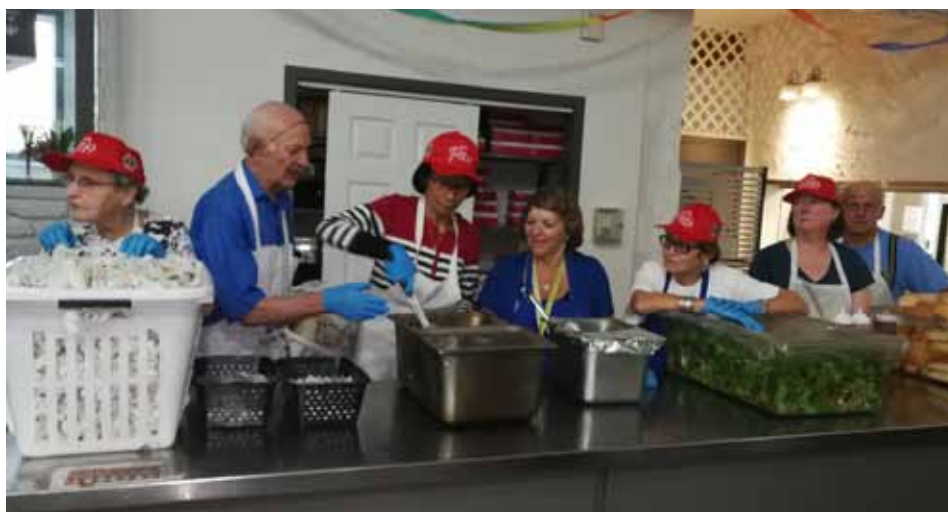
Edmonton Millwoods and South Edmonton Lions collaborate to prepare and serve supper to 300 clients at the Mustard Seed church on September 4.

Full information and application at: http://lionsc1.org/2019/05/20/mdc-regional-lions-leadership-institute/