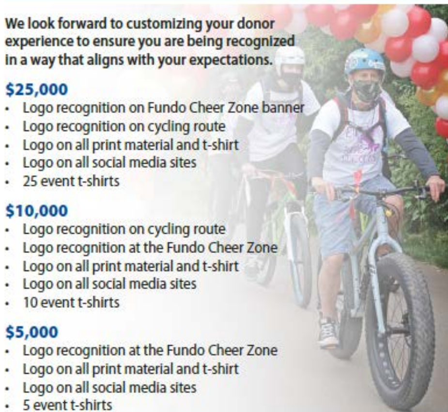
Participants from 2020 Fundo