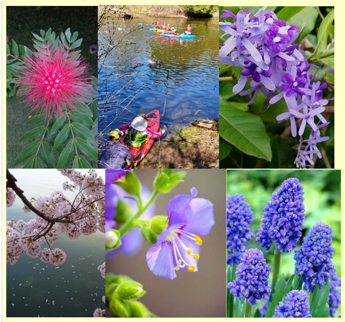
Yours In Lionism