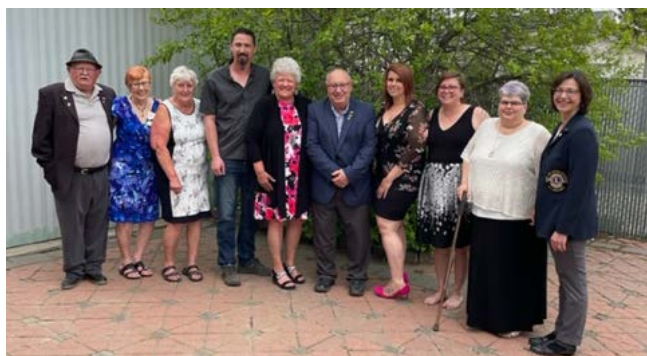
Millet & District Lions Club 48 th Anniversary Charter Celebration & Awards

inducted and to the Millet Lions Club celebrating their 48 th Charter Anniversary. These were fun evenings.