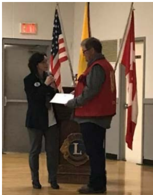
Consort Lions 50 th Charter Anniversary

August has been a busy month with great weather to enjoy! The month started with two 50 th Charter Anniversaries. I was honoured to be invited to celebrate the 50th Charter Anniversary of the Consort Lions Club on August 5, 2022 and the Pigeon Lake Lions Club on August 6, 2022. Both clubs recognized 50-year Lions charter members. I addressed the clubs and made presentations on behalf of the district. Congratulations to the Lions in these clubs who continue to serve in their communities.