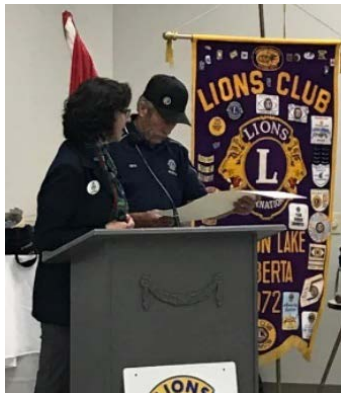
Pigeon Lake Lions 50 th Charter Anniversary

The District GLT coordinator organized and facilitated a successful Zone Chairperson training on August 13, 2022 for appointed zone chairpersons in our district. A special thank you to the trainers and participants. Lots of learning, sharing and fun was had by all!