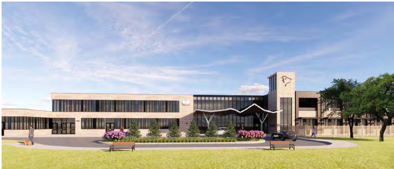
Rendering is for illustrative purposes and subject to change.