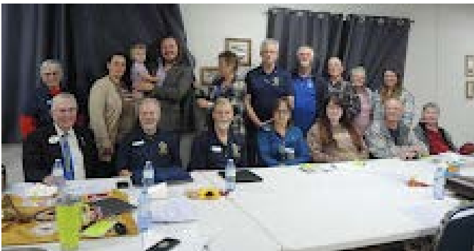
Zone meeting held at Vimy Re Centre on 8 October.