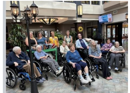
Eager residents ready to choose their quilt.

When the seniors receive their gift quilt, which they select from a variety of styles, colours, and patterns, they are incredulous and so grateful. The residents beam with pride when they receive their beautiful gift.