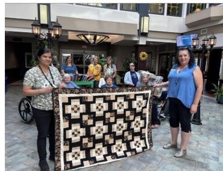
This quilt was donated as an honour quilt to provide dignity to those who had passed away.

In addition, all Edmonton (Millwoods) Lions Club members promote the project to other Lions